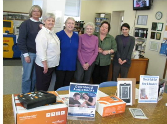
Library Board eReader Display