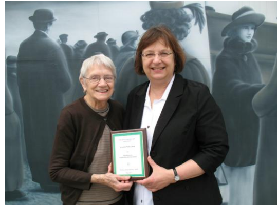
OLS-N Leadership & Innovation Award for "Journey Into Our Past."