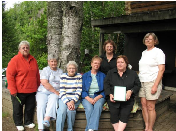
Schreiber Public Library Board OLS-N Award for Leadership & Innovation